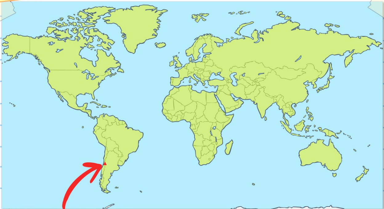
Location of Aconcagua.

The first known ascent of Aconcagua was by a Swiss climber Matthias Zurbriggen in 1897, though there is evidence of Inca civilisation near the summit so it may have been climbed long ago.