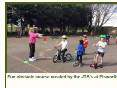
Fun obstacle course created by the JTA's at Elsworth