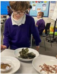
Year 6 'bush tucker trials' to kick start their topic, 'I'm a pupil, get me out of here!'

This week in assemblies we have been talking to the children about new beginnings which is an opportunity to reflect looking backwards and make improvements moving forward into the new year. As a Federation we also want to take this opportunity to do this as we work in partnership with you. Therefore, if you have any concerns, queries or praise please do share this with your child's class teacher or a member of the staff team. We want to positively work together for the good of the children. We have enjoyed welcoming everybody back to the start of a new year and new term. The staff and children have begun their new topics with enthusiasm and excitement and have produced some wonderful results already.