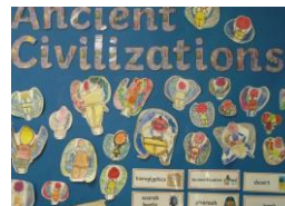
Year 3 created some cartouches for their new topic.