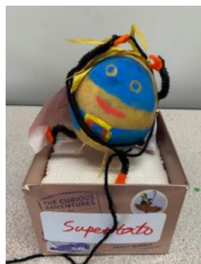
Ellie - Year 1 - Supertato