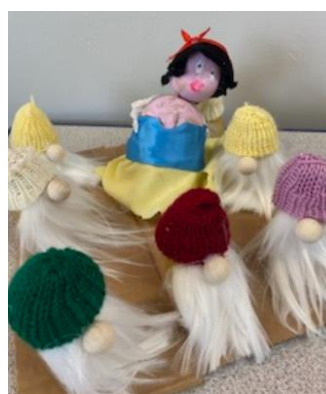
Amaya - Year 2 - Snow White and Seven Dwarves