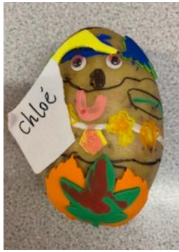
Chloe - Nursery