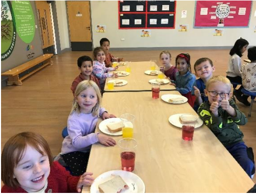
Our tea party!